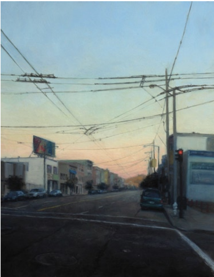
CARL DOBSKY, WIRES #5, OIL ON PANEL, 14 X 11"