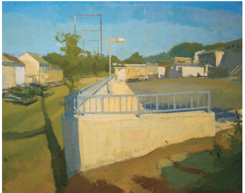
PETER VANDYCK, PARKING LOT, OIL ON RAGBOARD, 18 x 24"