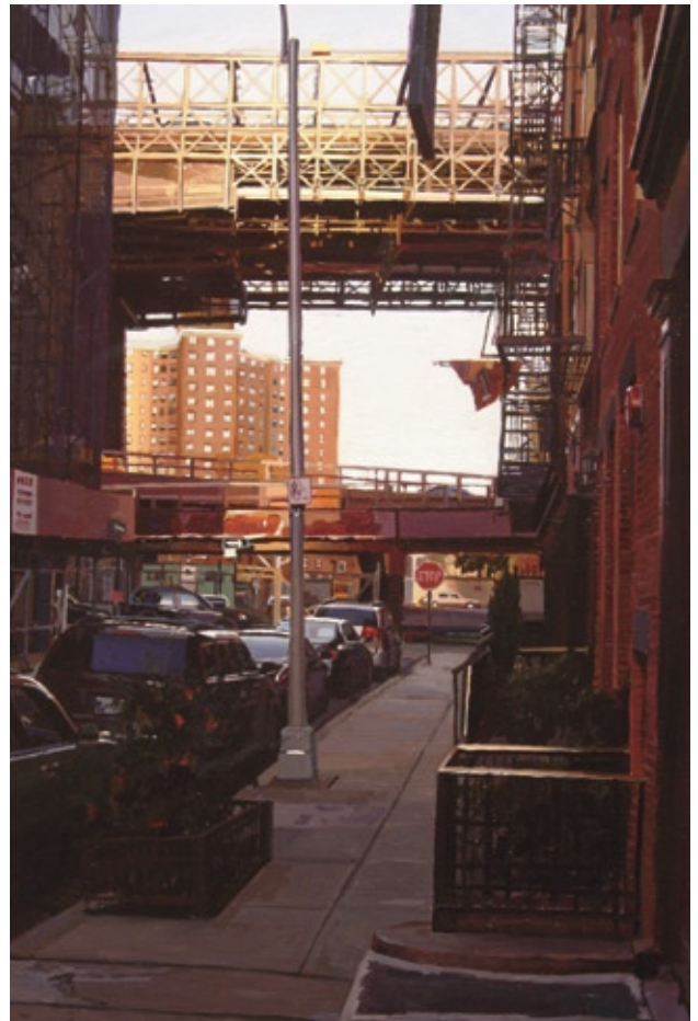
GREGORY GANDY, BROOKLYN BRIDGE, OIL ON PANEL, 18 X 12"